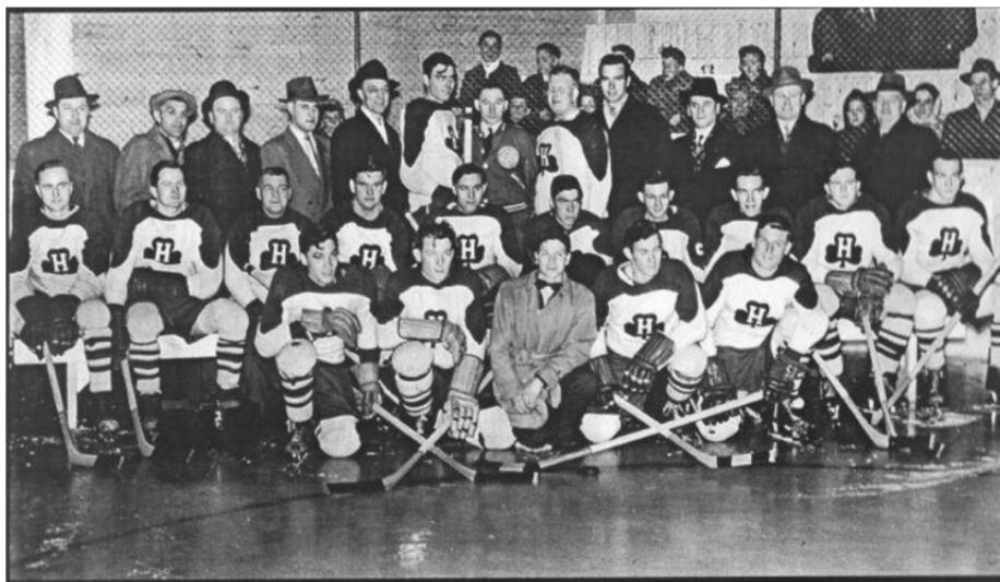
1947 Hespeler Juvenile Championship Team.

The travel teams in HHMA have captured approximately 40 OMHA Championships and Finalists Titles.