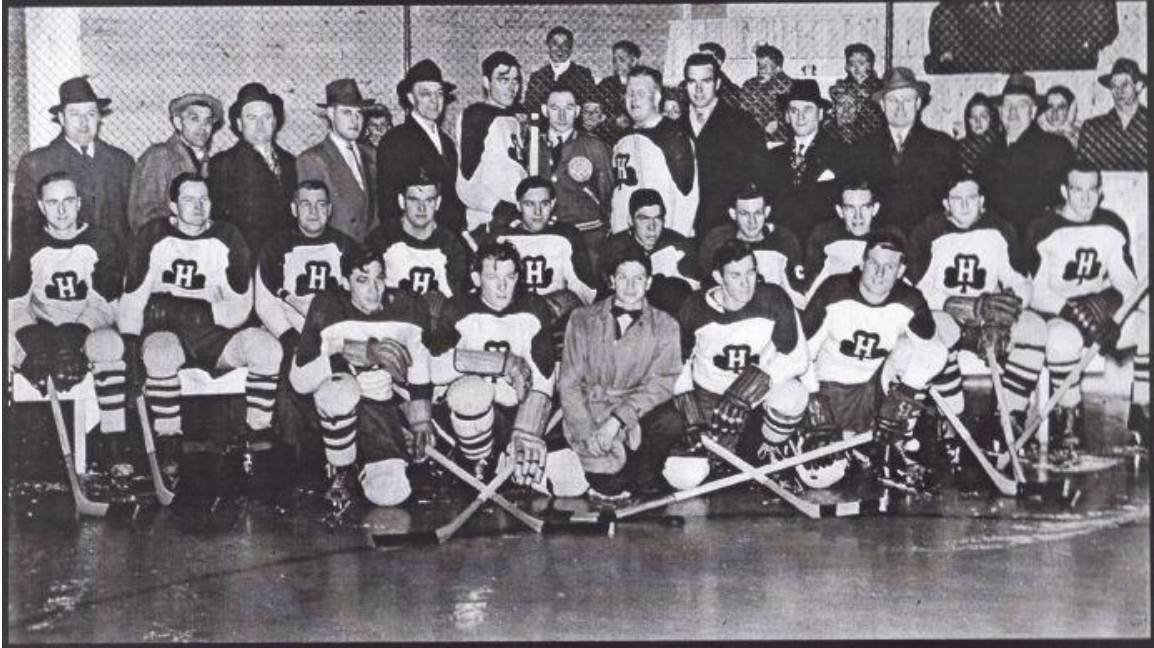
Here is a photo of the Hespeler Midet "A" OMHA Champions from 1969